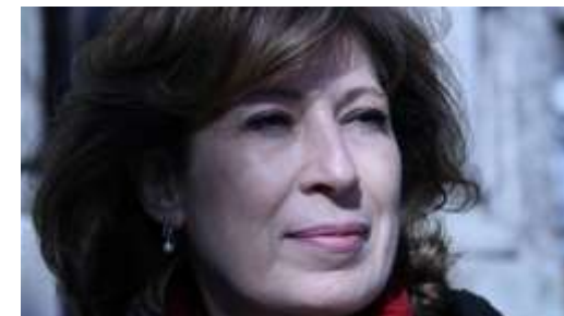
Keynote Speaker: Dr. Mona Nemer (University of Ottawa)